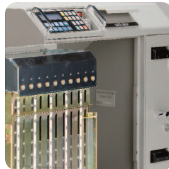
Deposits remain secure during change loads

The CacheSYSTEM® 7000 series provides the ultimate level of cash control by limiting cash exposure and providing seamless accounting between the POS and your bank. It offers the combined benefits of cash-counting and bill validation with change-fund management and an audit trail of all transactions.