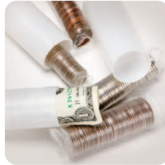
User-determined change denominations